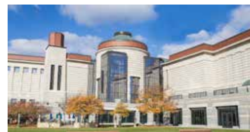
Visit the Minnesota History Museum