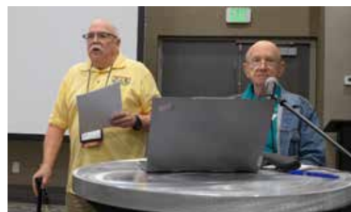
Meet and talk with the GNRHS's Board of Directors at the Annual Meeting