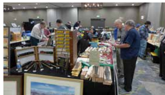
Buy, sell, or trade at the Swap Meet