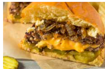
Dine at one of the several restaurants that offer the Twin Cities local creation affectionally known as a "Juicy Lucy"

Visit the Stone Arch Bridge. The bridge's downtown side was closed in December for repairs, but the St. Anthony Main side is open for pedestrians and bicyclists.