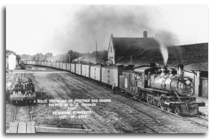
Trainload of onions & potatoes from Princeton. September 20, 1937