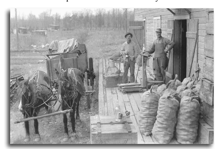
Long's Siding warehouse scene - 1918

Lunch and a surprise souvenir also await you in Princeton.