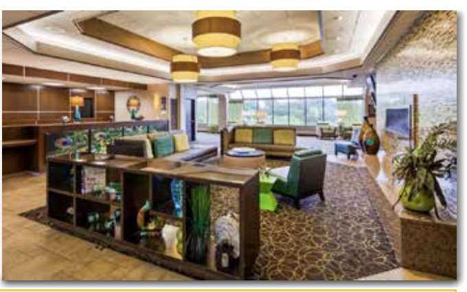
HOSTING HOTEL FOR THE 2023 GNRHS CONVENTION; BEST WESTERN PLUS KELLY INN IN ST. CLOUD. HOTEL IS LOCATED IN THE HEART OF DOWNTOWN, OVERLOOKS THE BANKS OF THE MISSISSIPPI RIVER, AND IS WITHIN WALKING DISTANCE OF UNIQUE SHOPS AND RESTAURANTS